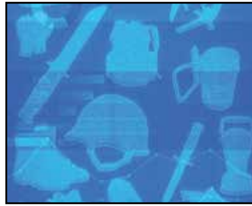
PRODUCT REVIEWS FOR SPRING 2014 - p58