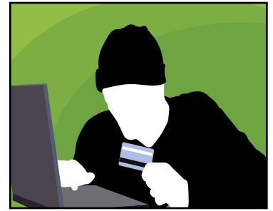
PROTECT YOUR BUSINESS FROM CYBER CRIME - p30