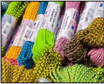
USING PARACORD IN A SURVIVAL SITUATION - p42