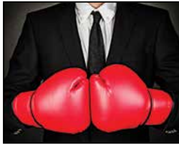
KEEP YOUR COMPANY COMPETITIVE IN 2014 - p34